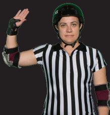
OUT OF PLAY WARNING