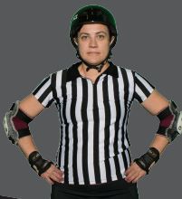
JAMMER CALL OFF