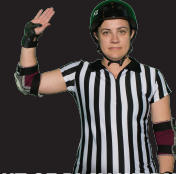
OUT OF PLAY WARNING