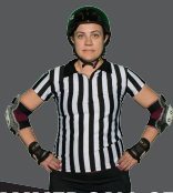
JAMMER CALL OFF