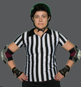
JAMMER CALL OFF