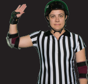
OUT OF PLAY WARNING